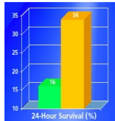
Bar graphs above and on the left show the dramatic increase in blood pressure during the use of the ResQPOD and survival rates